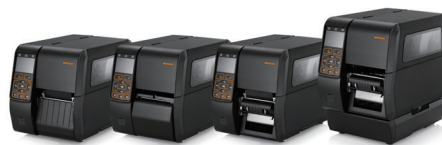
Standard Auto cutter Peeler Rewinder + Peeler