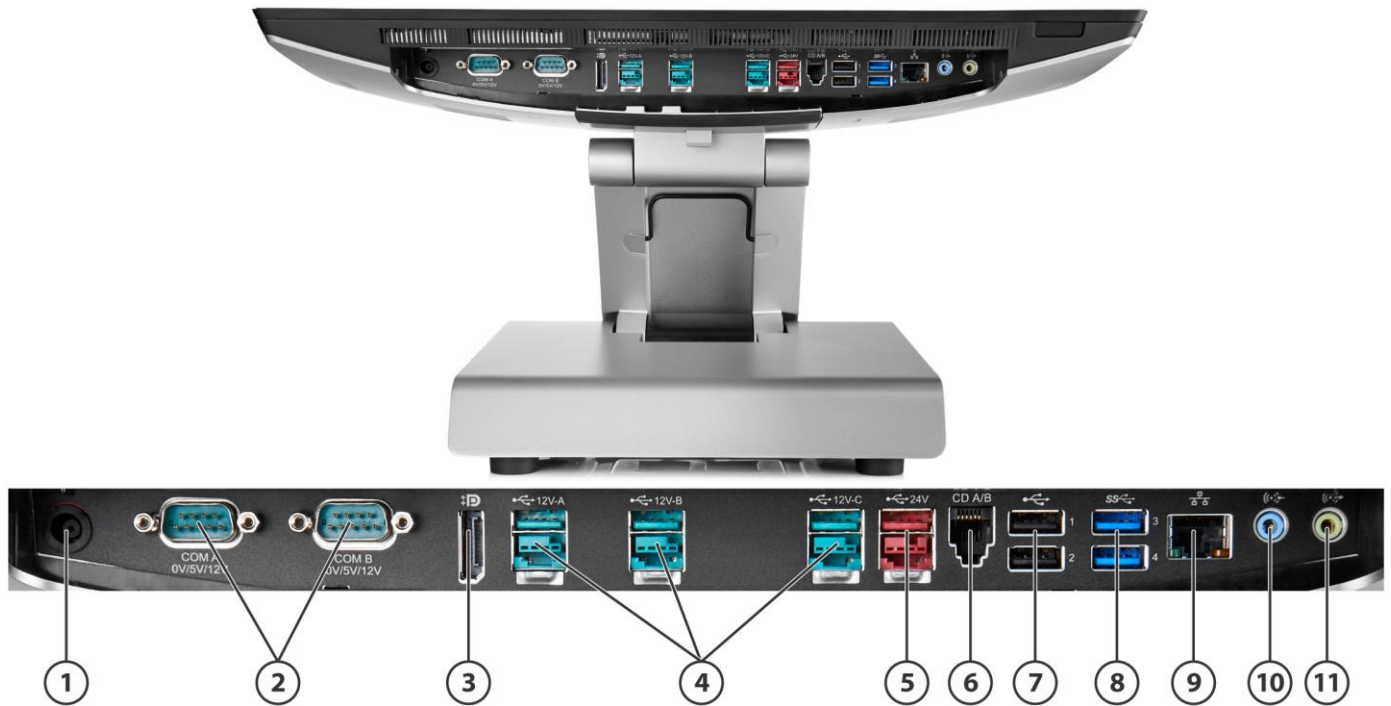
Image shown with ergonomic stand