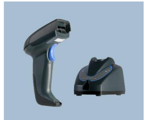
QuickScan Mobile Reader and Cradle